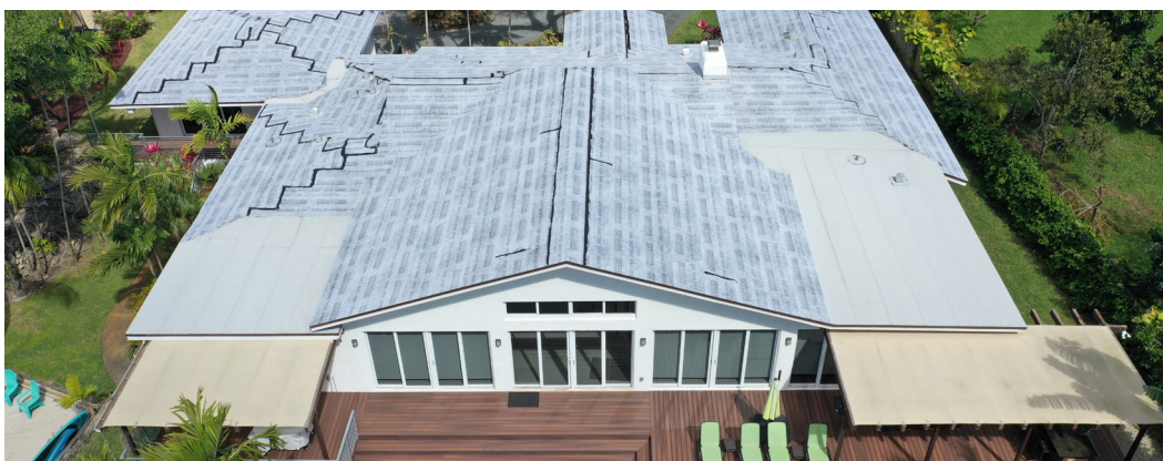
Polystick TU Plus has been a proven wind and waterproofing barrier for over 20 years.