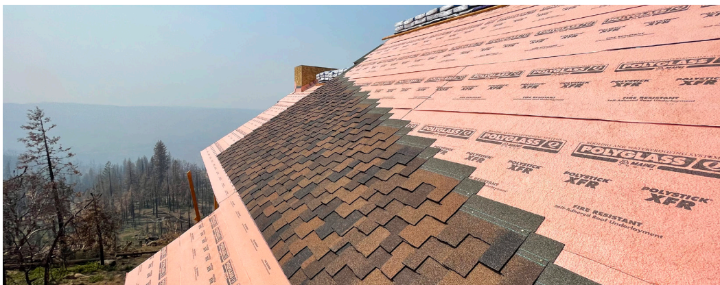
Polystick XFR provides tested ember & fire resistance for urban areas and regions prone to wildfires