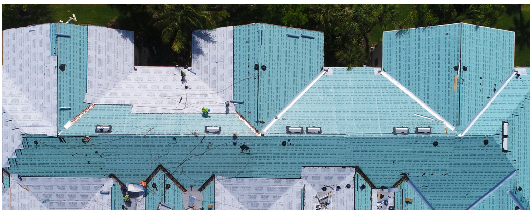
Polystick MTS PLUS can be used as a single layer high temp underlayment or as a base layer in a two-ply system for up to 30 year warranty.