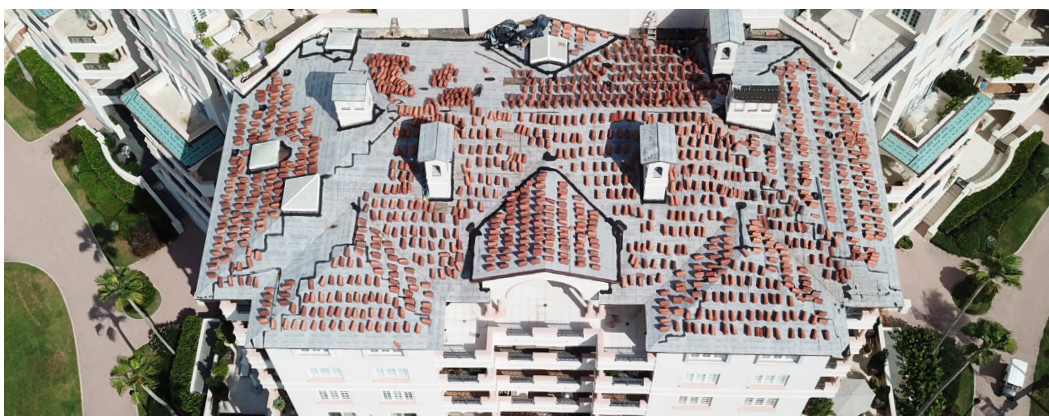
Polystick TU Max has a tough top fabric design engineered for foam set or mechanically fastened tiles.