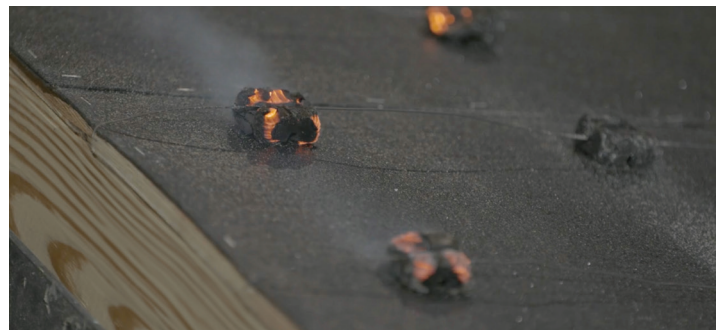
Polyanchor XFR passed Class C burning test under ASTM E108, with no roof covering.

**All values are nominal at time of manufacturing