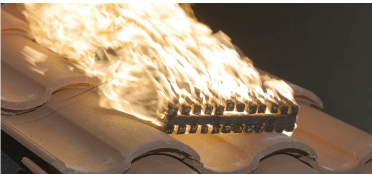
Polyanchor XFR passed ASTM E108 Class A burning brand test under tile.