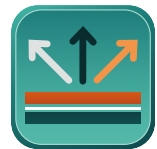
MULTIPLE SURFACE SOLUTIONS