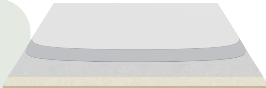
1 PLY PolyBrite® Climate Series + PolyBrite® 71 Base Coat Polyglass LS MAX