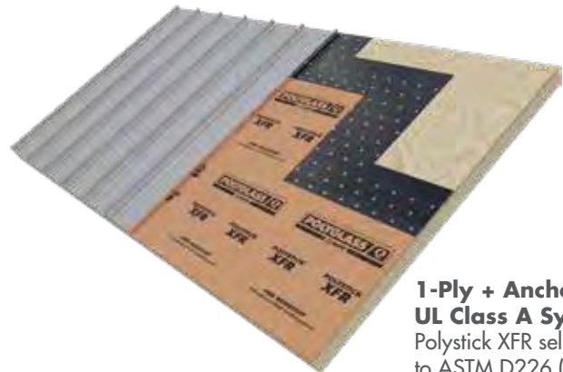
1-Ply + Anchor Sheet UL Class A System: Polystick XFR self-adhered to ASTM D226 (II) 30# Felt anchor sheet onto Plywood under Standing Seam metal