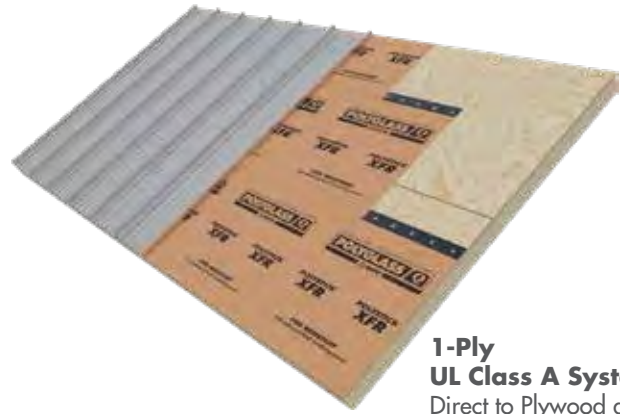
1-Ply UL Class A System: Direct to Plywood deck application of self-adhered Polystick XFR under Standing Seam metal

Metal has many great qualities as a roof covering but for all intents and purposes it is not fire resistant. Why? Because metal transmits heat very efficiently and therefore a fire resistant sheet is needed to help it achieve a UL Class A fire rating. By simply installing Polystick XFR under a UL Listed steel or copper covering , the roof system achieves Class A.