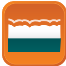
THIN FILM TECHNOLOGY